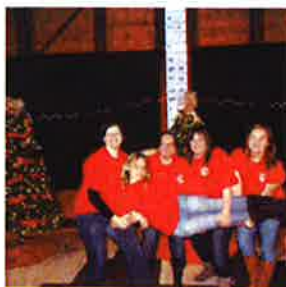
HEALTH SERVICES DEPARTMENT STAFF (CHRISTMAS 2013)