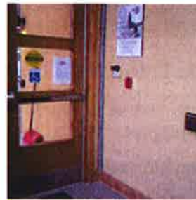
ACCESSIBLE DOOR OPENER (ADMINISTRATION BUILDING)

accommodate and provide services to persons with disabilities.